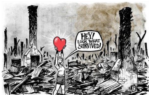
A cartoon from The Mercury celebrating the spirit of courage and compassion in evidence among Tasmanians following the 2013 fires.