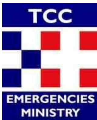
The TCC's new Emergencies Ministry logo.