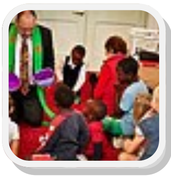
Photo: During the children's talk at the 2012 Christmas Bowl launch at Hobart North Uniting Church.

Thank you for supporting the Christmas Bowl in 2013-2104! With the help of the Christmas Bowl, our Act for Peace project partners assist more than one million people living in Africa, Asia, the Middle East, the Pacific & Australia.