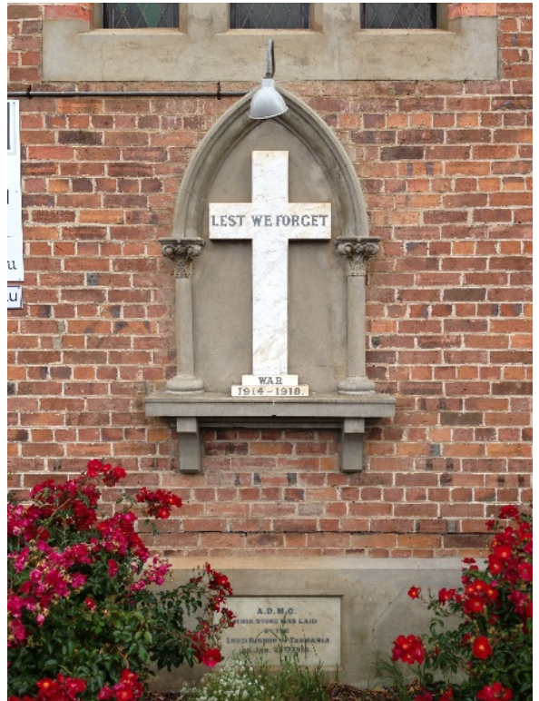
War memorial built into the front of the Anglican Church in Exeter. It is common for church interiors to have honour boards commemorating the sacrifices of service personnel, and there are often strong community attachments to these elements.

Significant meanings, including spiritual values, of a place should be respected. Opportunities for the continuation or revival of these meanings should be investigated and implemented. Australia ICOMOS Burra Charter, 2013, Article 24.2.