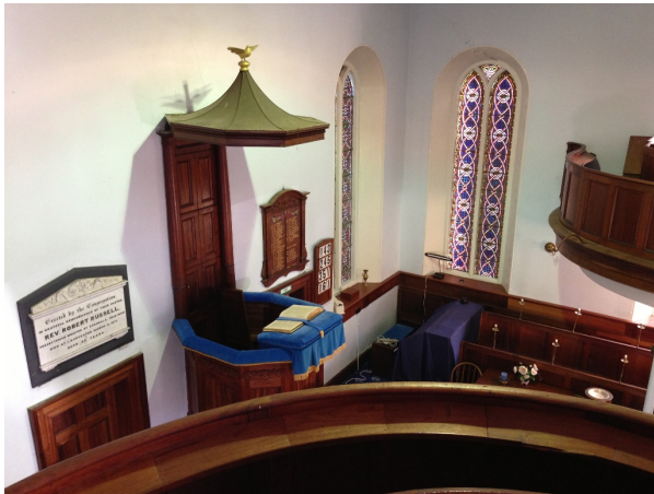
St Andrews UCA, Evandale: an interior demonstrating the liturgical practices of its Presbyterian heritage.