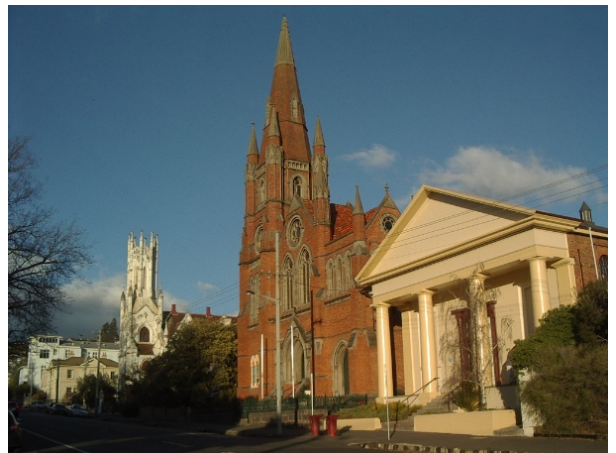
Contributing to a sense of place: Chalmers Church, City Baptist and Milton Hall in Frederick Street, Launceston.

Tasmania's historic places of worship, whether they continue to operate as a place of worship or are used for other purposes, are an important part of the fabric that defines Tasmania's sense of place. The custodians of these places fulfil an important role in helping to present, maintain and care for them, and for this the Heritage Council is immensely grateful.