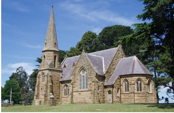
Former Methodist Church, Ross.