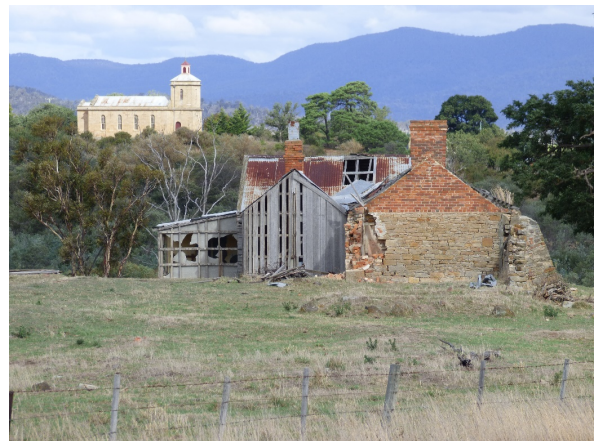
St Thomas Anglican Church, Avoca, a landmark building.

Many are landmark buildings or focal points that aid wayfinding in cities, towns and rural environments and contribute to the local 'sense of place'. Often seen in a natural or landscaped setting, sometimes located next to or near a cemetery, places of worship are appreciated for their aesthetic qualities and have long been favoured as subjects for drawings and photographs. The quiet of their interiors provide refuge and an environment conducive to spiritual and aesthetic contemplation. Many continue to provide spaces imbued with spiritual meaning for the continuation of religious observance and social gathering. Even after they cease to be used for worship, most of these places continue to be valued by the community for spiritual or social reasons.